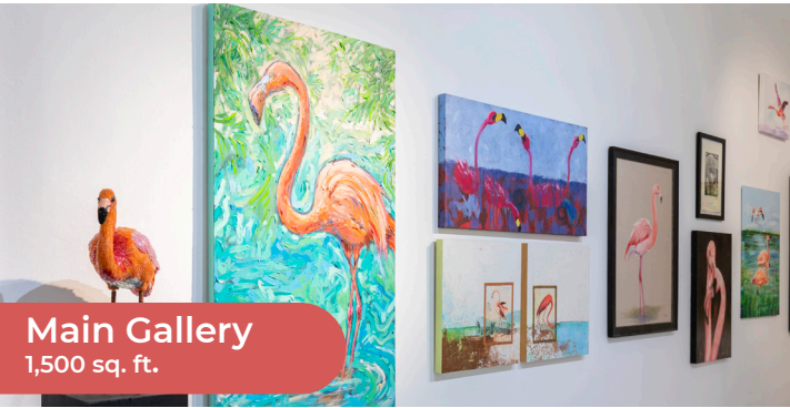
Main Gallery 1,500 sq. ft.