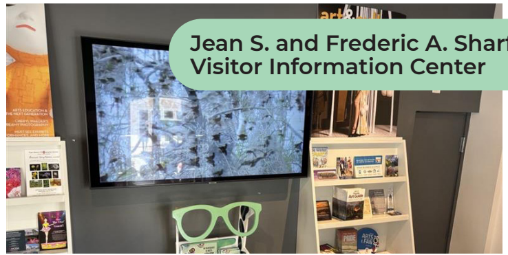
Jean S. and Frederic A. Sharf Visitor Information Center