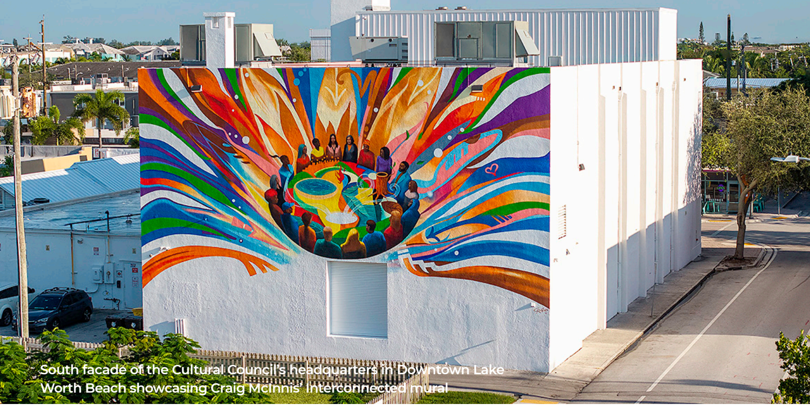
South facade of the Cultural Council's headquarters in Downtown Lake Worth Beach showcasing Craig McInnis' Interconnected mural