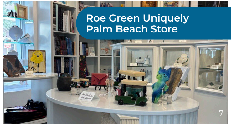
Roe Green Uniquely Palm Beach Store