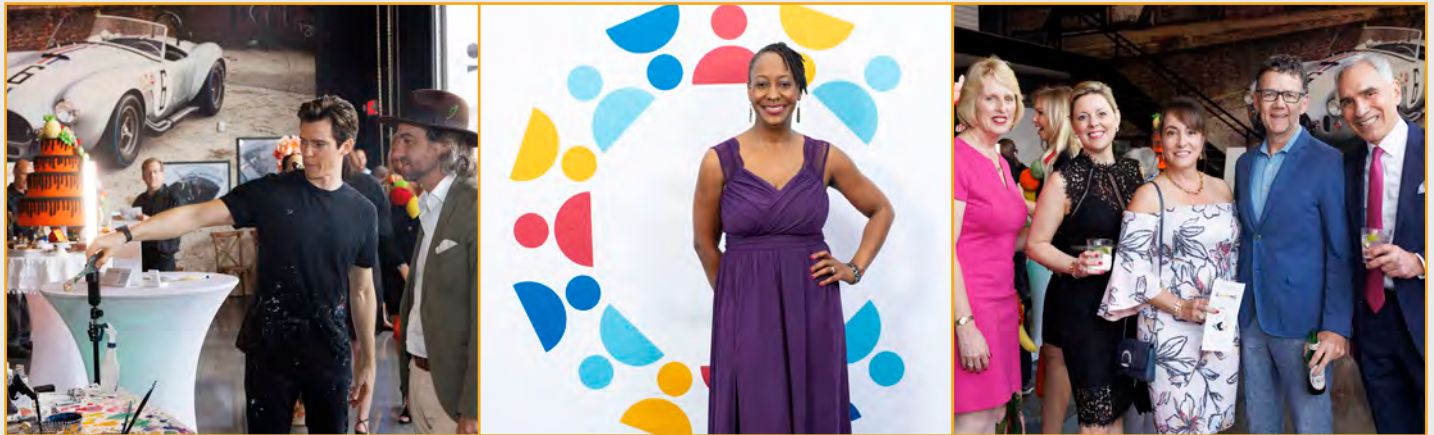
Scenes from our 2024 event

Join us for An A-Muse-ing Evening: Art in Motion , the most enchanting and creative award ceremony in Palm Beach County. Immerse yourself in art and movement while indulging on delectable light bites, craft cocktails, mesmerizing performances, and intriguing works.