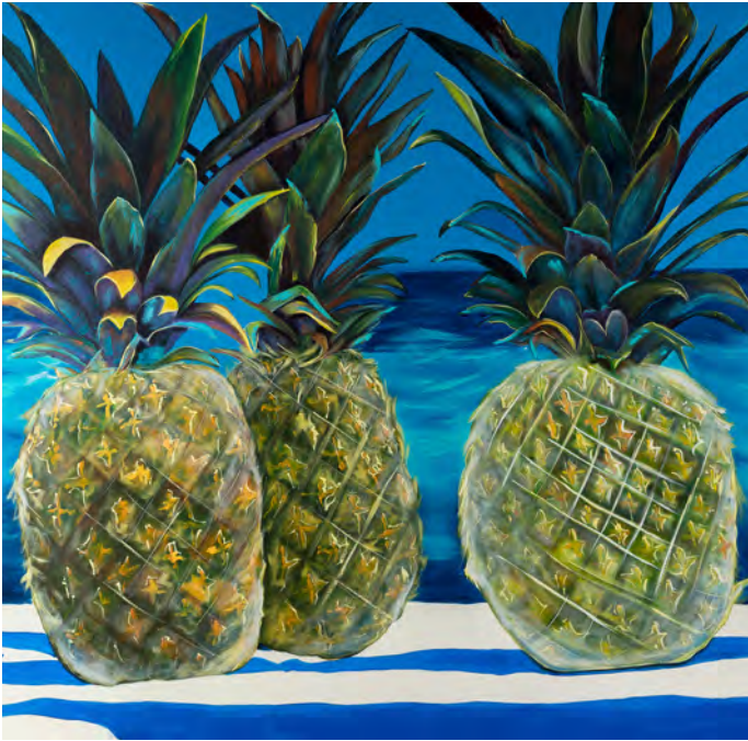
Sonia Giusto, Tropical Pineapple (detail)

Below images from Reflections of a Century: Celebrating Boca Raton's 100 Years through Art