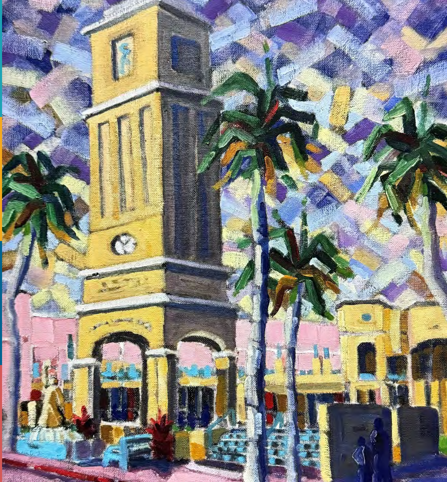
Ralph Papa, Tower at Mizner Park (detail) | Reflections of a Century: Celebrating Boca Raton's 100 Years through Art