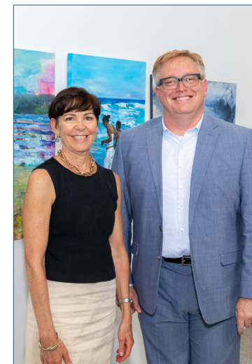
Opening reception of Contemporary Art of the Latin American Diaspora , 2022